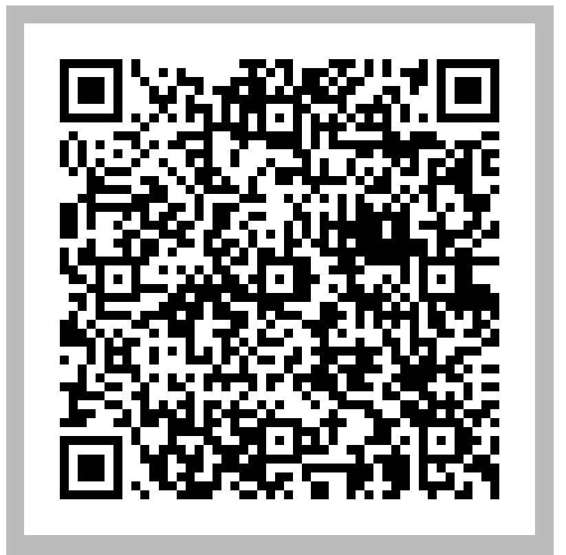
Scan the code above with your mobile device to go directly to the The Online Letting Agents Ltd website for Torquay Flat with FREE heat and water